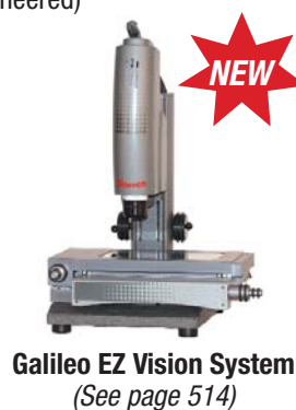
Galileo EZ Vision System (See page 514)