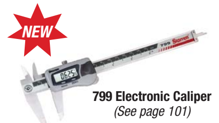
799 Electronic Caliper (See page 101)