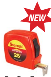
Roofing Tapes (See page 527)