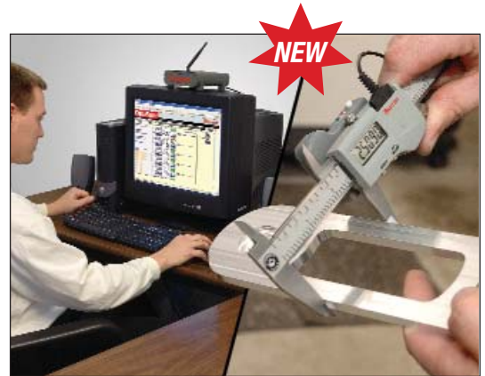
DataSure Wireless Data Collection System System (See page 250)