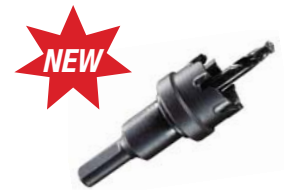
TCT Tungsten Carbide Tipped Sheet Metal Hole Saw Assemblies (See page 597)