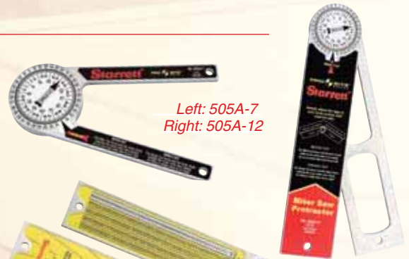
Left: 505A-7 Right: 505A-12