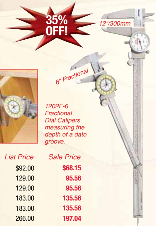
1202F-6 Fractional Dial Calipers measuring the depth of a dato groove.

Fractional (F-Series) Calipers: 1/64th grad. on yellow outer scale, .01" grad. on white inner scale