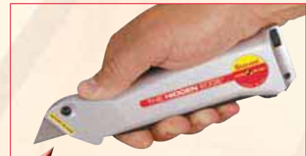
968 Belt Holster for Hidden Edge® Utility Knife