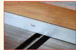
380-24 Steel Straight Edge