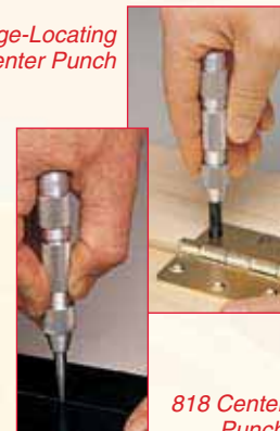
818 Center Punch